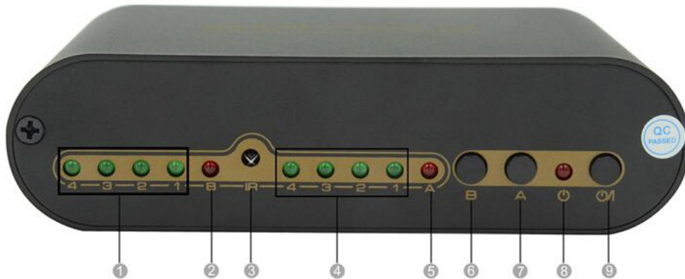
Figure 1.0 Front Panel Showing Picture