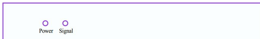
FIG.1.0 Front Panel View

NOTE : EDID MODE: After the splitter is powered on, and then there is a display machine connected to the OUT1, the splitter will get the EDID of display machine connected OUT 1. If there is no any display machine connected to output1, the machine will use default EDID output.