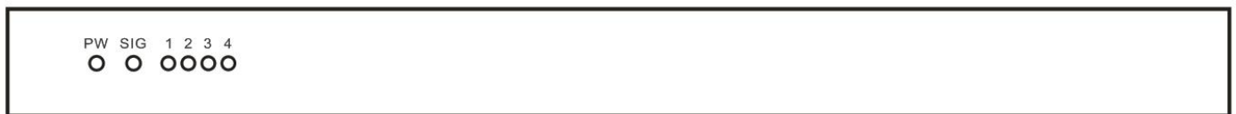
FIG.1.0 Front Panel View

NOTE : EDID MODE: After the splitter is powered on, and then there is a display machine connected to the OUT1, the splitter will get the EDID of display machine connected OUT 1. If there is no any display machine connected to output1, the machine will use default EDID output.